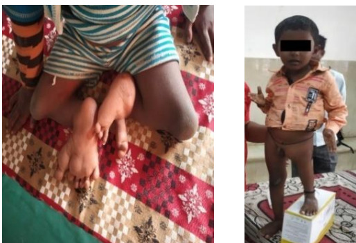
Persons having Multiple Disabilities in camps at Indore [Madhyapradesh], Ramnad, [Tamilnadu], Hubli [Karnataka], and Chandrapur, Maharashtra